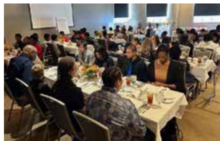
RTV cadets and mentors look forward to the etiquette luncheon experience every year. (left)

"Exposure Events" – trips to museums, athletic events, and fishing and archery instruction. These experiences facilitate the development of relationships with adult mentors and face-to-face interactions with their peers.