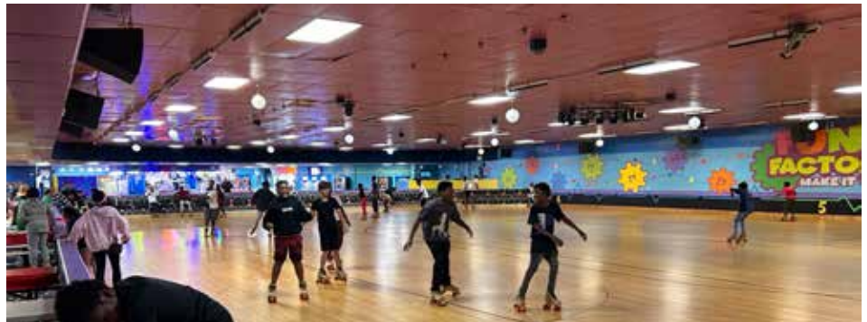
RTV cadets roller skate at an "Exposure Event" at Indianapolis' Fun Factory (above).

The program's goal is to help students think about life beyond their current realities through sessions and